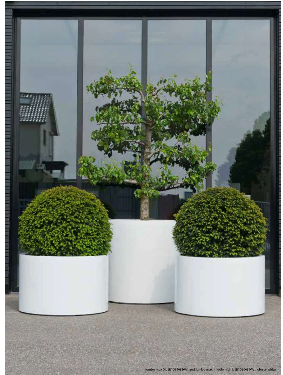
jumbo max XL (E1081-S1-W) and jumbo max middle high L (E1086-S1-W), glossy white