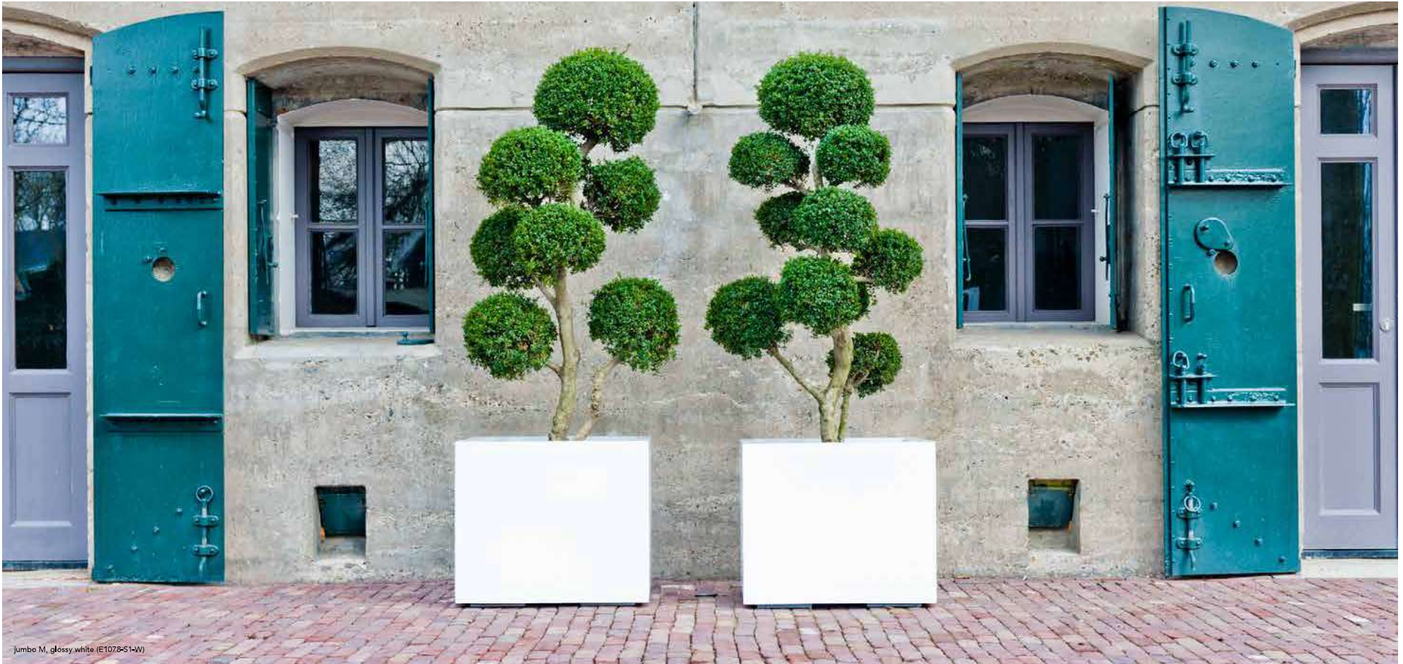
Jumbo M, glossy white (E1078-S1-W)