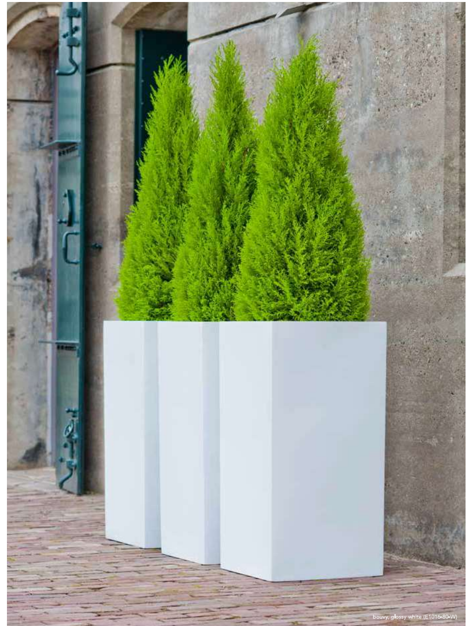
bouvy, glossy white (E1016-80-W)