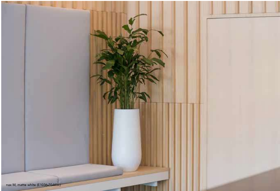
nax M, matte white (E1036-70-MW)