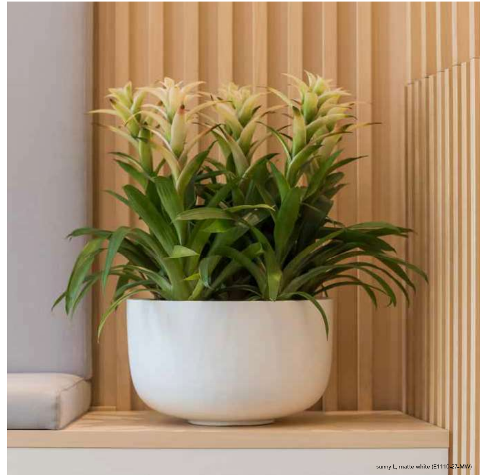
sunny L, matte white (E1110-27-MW)