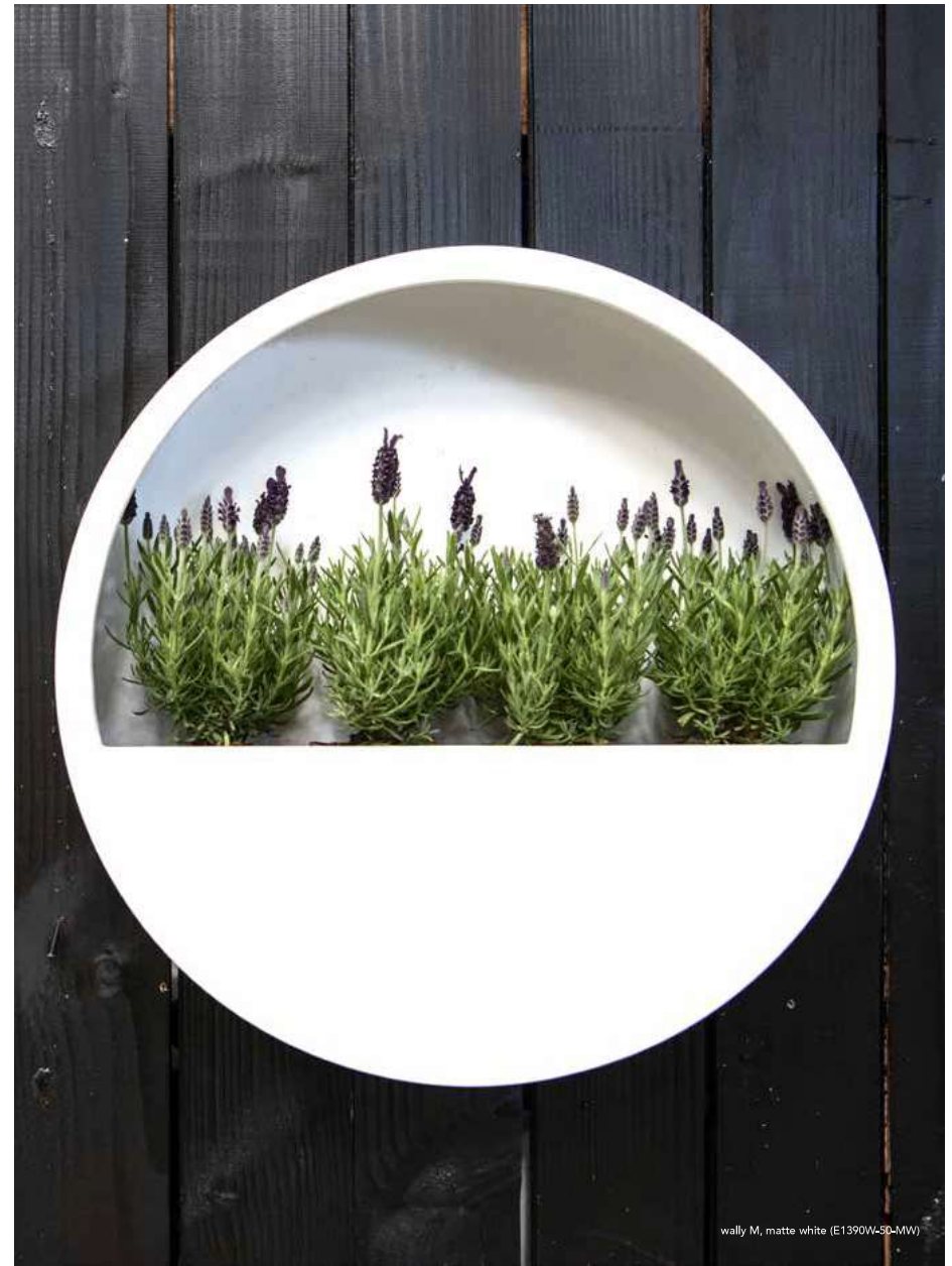
wally M, matte white (E1390W-50-MW)