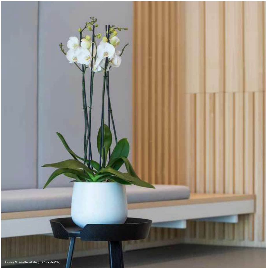
kevan M, matte white (E3017-S1-MW)