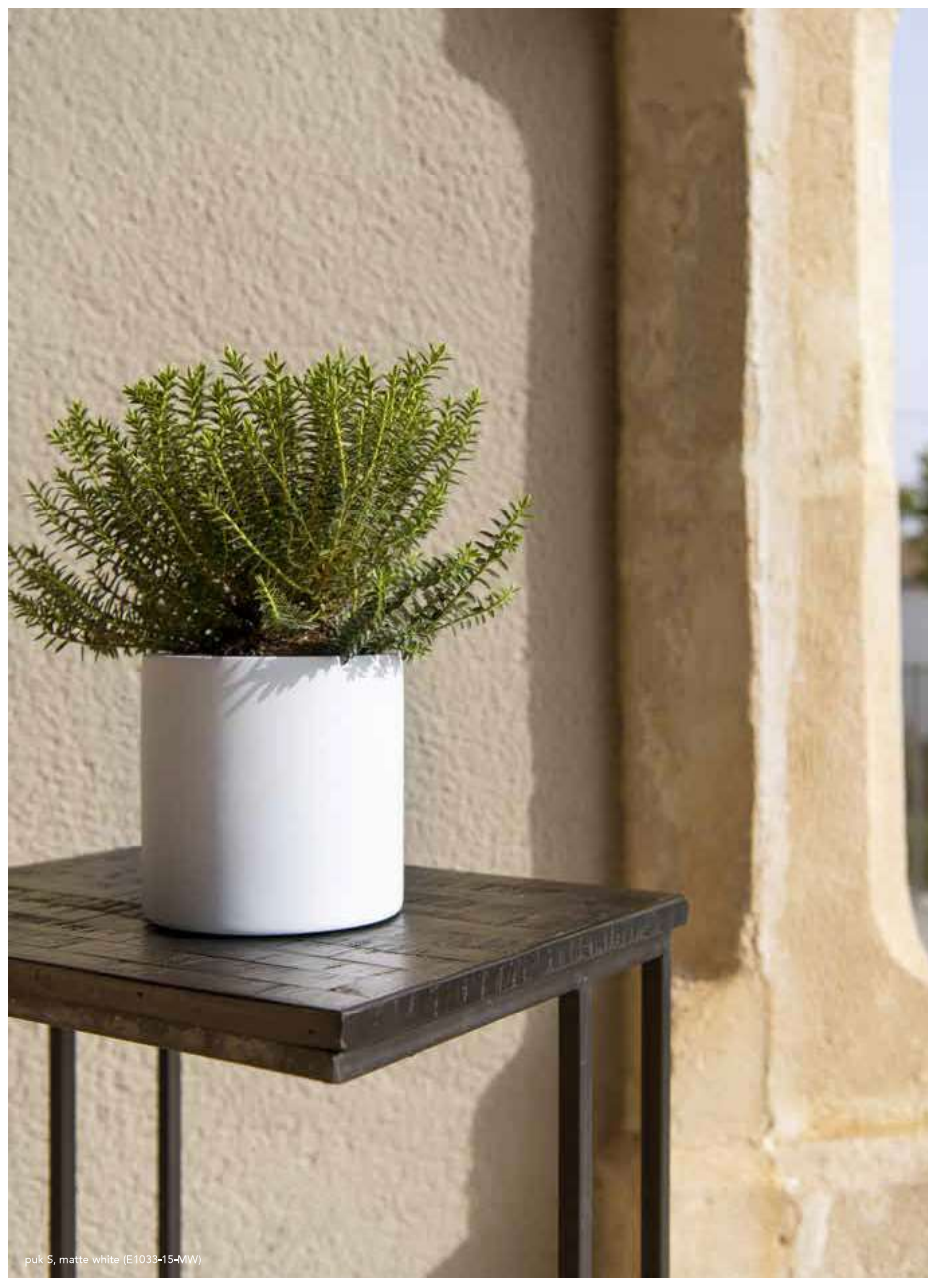
puk S, matte white (E1033-15-MW)