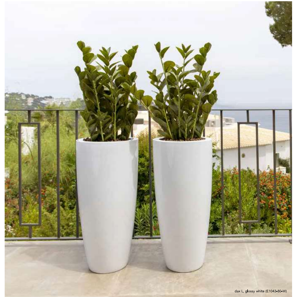
dax L, glossy white (E1043-80-W)