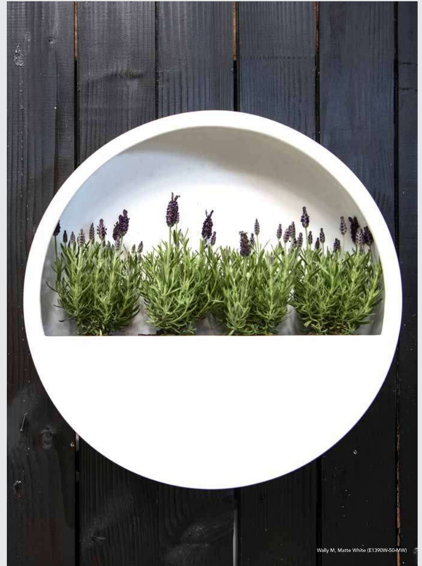
Wally M, Matte White (E1390W-50-MW)