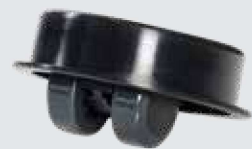
Pot wheels More info on page 145.