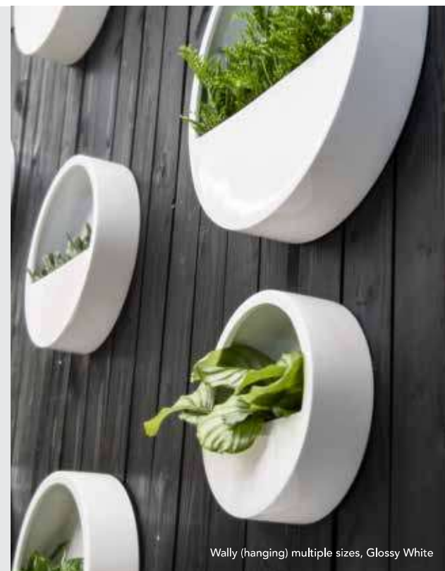
Wally (hanging) multiple sizes, Glossy White