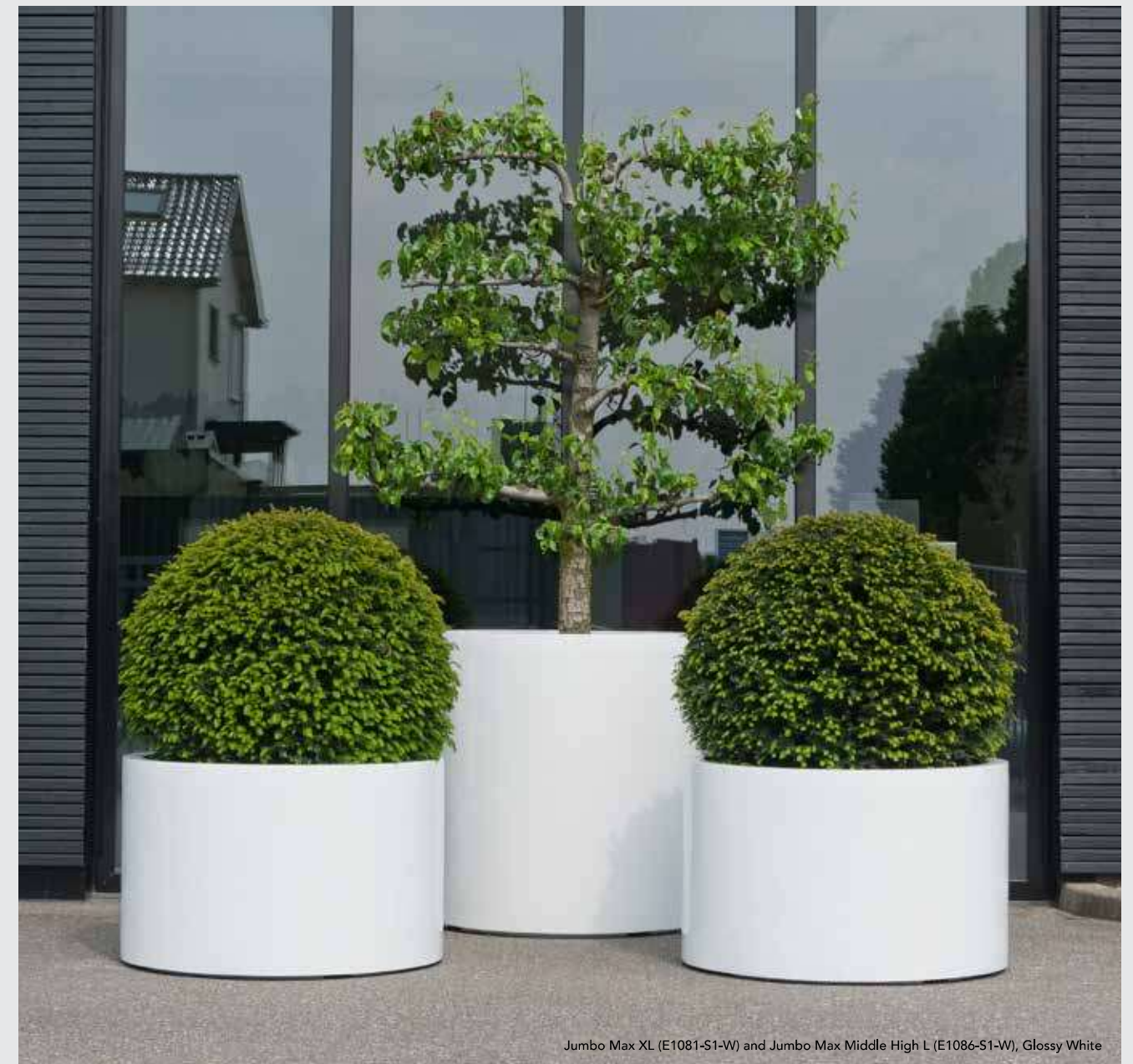
Jumbo Max XL (E1081-S1-W) and Jumbo Max Middle High L (E1086-S1-W), Glossy White