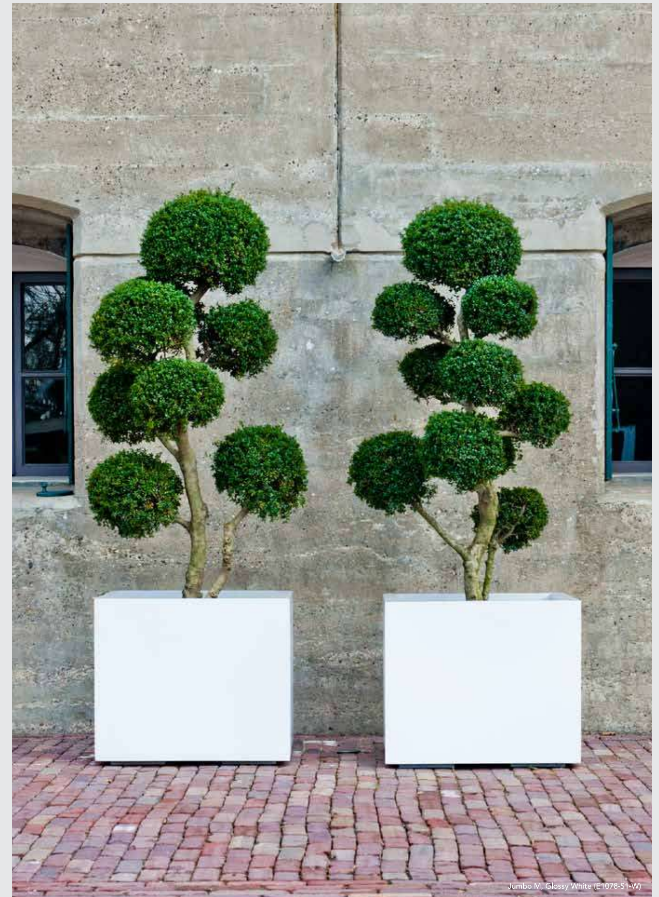
Jumbo M, Glossy White (E1078-S1-W)