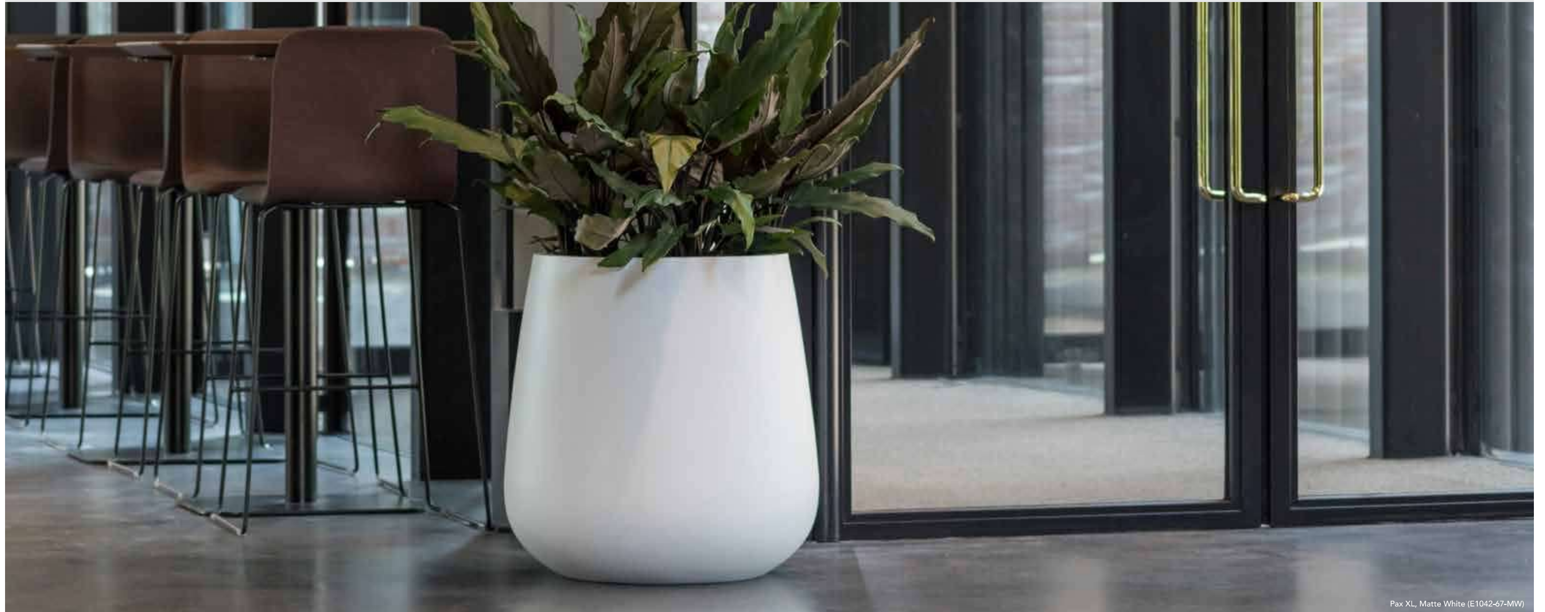
Pax XL, Matte White (E1042-67-MW)