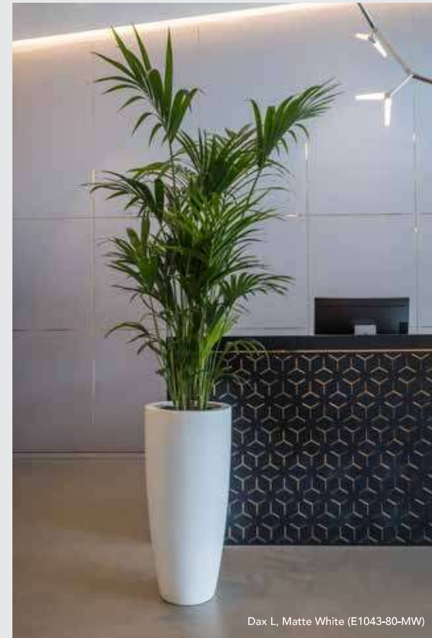
Dax L, Matte White (E1043-80-MW)

The essential collection stands out as a versatile solution, especially when paired with pot wheels. This combination provides a multitude of possibilities, transforming planters into room dividers, using them to improve acoustics, or any other creative purpose you envision.