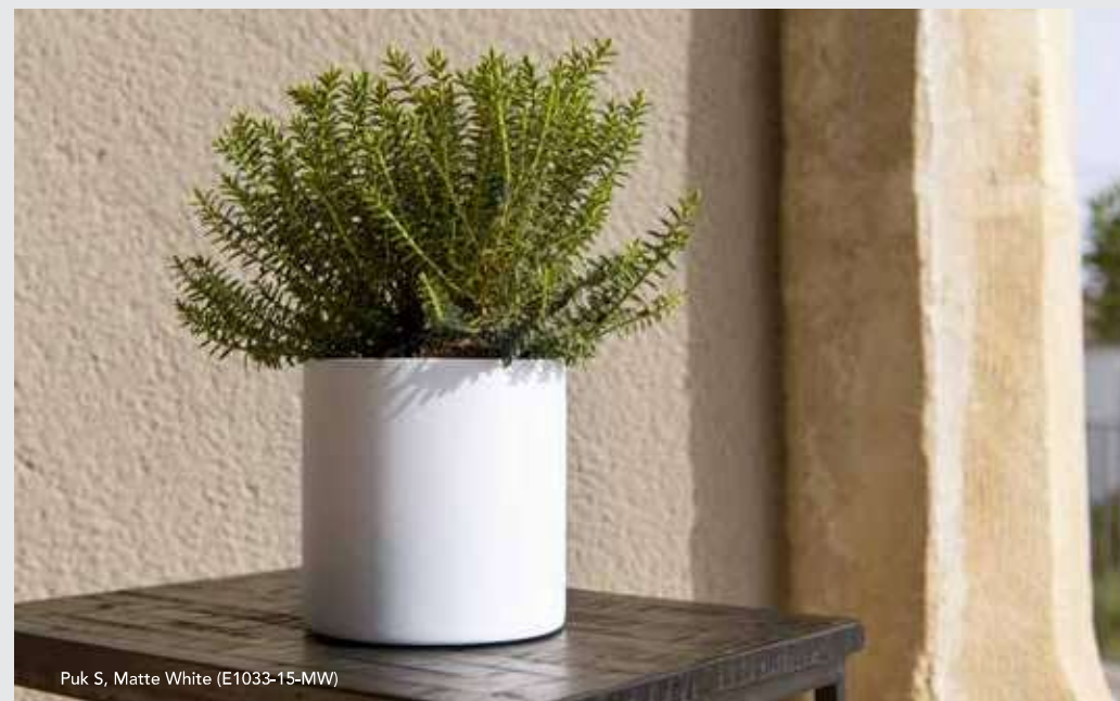
Puk S, Matte White (E1033-15-MW)